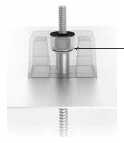
Water Seal raises the EPDM seal 0.7 inches above the flashing and protects it with a cast-aluminum block.

Available finishes: aluminum mill (A); bronze anodized (B); clear anodized (C)