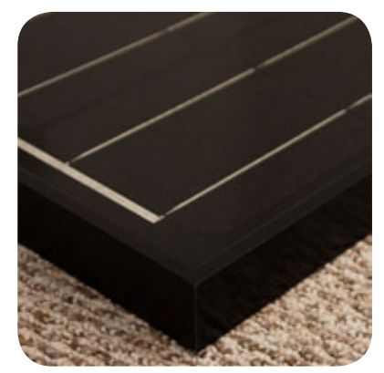
Available with black frames & black backsheeting (shown) as well as silver frames & white backsheeting

High-efficiency monocrystalline solar cells. Produces high maximum power output even under low light conditions