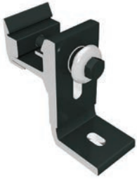
Ultra Rail Comp L Foot