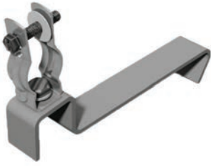
Conduit Support - Tile