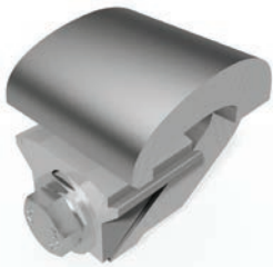
Universal End Clamp