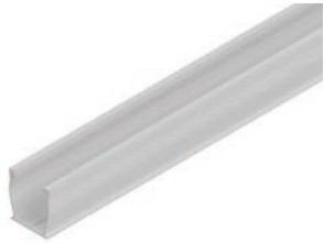
UR-40 Rail, Silver