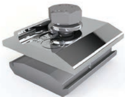
Ground Lug R, 6-12 AWG