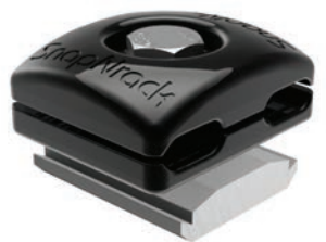
Universal Wire Clamp