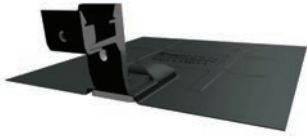
Ultra Rail Comp Kit