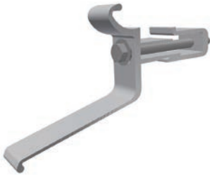
Skirt Frame Mount