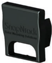
UR-40 End Cap