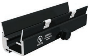
Ultra Rail Splice