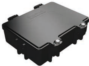
Junction Box XL