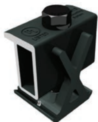
Bonding Adjustable End Clamp, Black