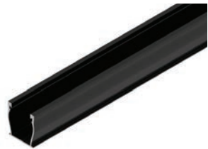
UR-40 Rail, Black