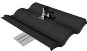
Ultra Rail W Tile Replacement