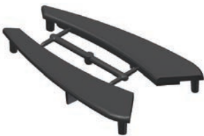
Skirt End Cap Pair