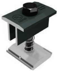
Bonding Mid Clamp, Black