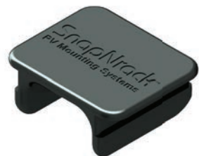
Wire Retention Clip