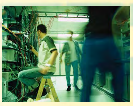
Potential Cost Avoidance Due to Square D Switch Life