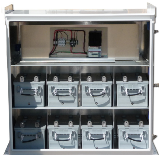
Back Panel Assembly