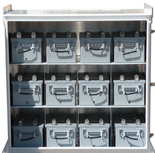
(12) Battery Bank : 8G8D