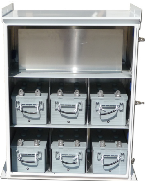
(6) Battery Bank : 8G8D