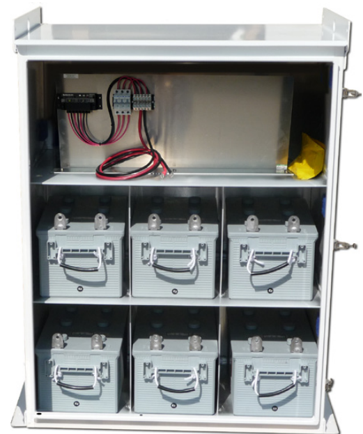
Back Panel Assembly