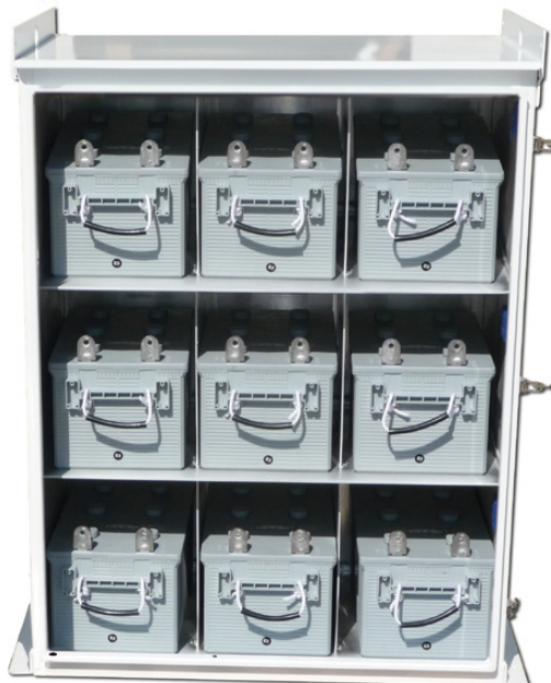
(9) Battery Bank : 8G8D