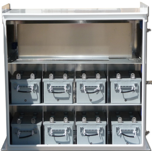
(8) Battery Bank : 8G8D