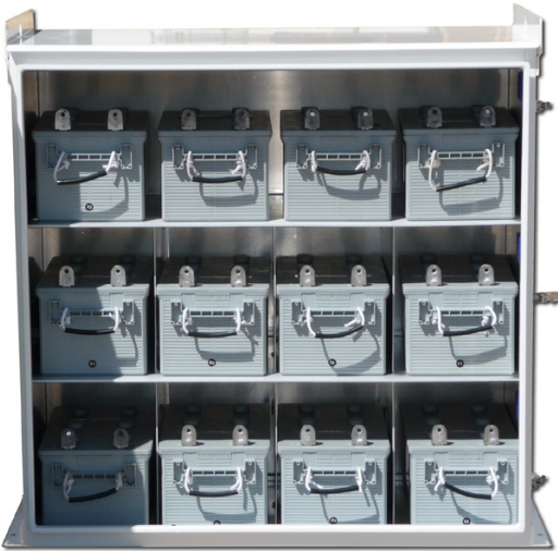
(12) Battery Bank : 8G8D