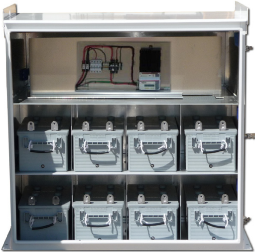
Back Panel Assembly