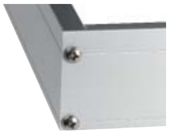
Clear Anodized Universal Frame