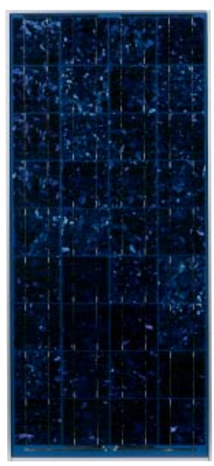
BP SX 60