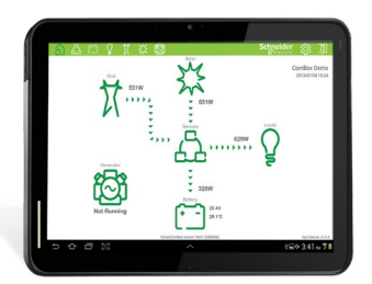
Conext ComBox Android tablet application