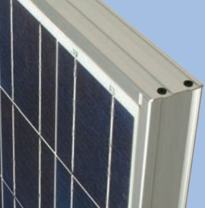
Improved Frame Technology