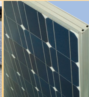
The NU-U235F2 offers industry-leading performance for a variety of applications.