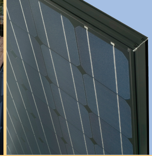
Laminated glass construction in a high torsion frame.