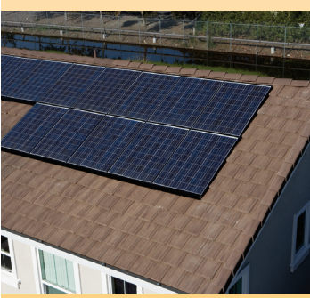
Black frame improves aesthetics for residential roof top applications.

This module uses an advanced solar cell surface texturing process to increase light absorption and improve efficiency.