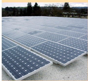
The NU-U240F2 offers industry-leading performance for a variety of applications.

156 mm pseudo-square monocrystalline solar cells provide high power output. Ideal for large commercial rooftops where space is a premium.