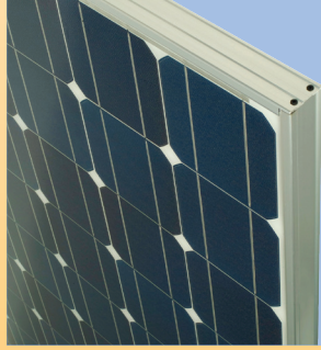
Improved Frame Technology