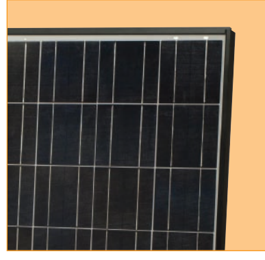
Special side flanges mount easily and securely to Sharp's innovative new racking system

These poly-crystalline 187 watt modules offer high-powered performance with an efficient design for quick and easy installation. For use specifically with Sharp's solar racking system (SRS), they are designed to offer easier and faster installations. Using breakthrough technology perfected by Sharp's more than 45 years of research and development, these modules use a textured cell surface to increase light absorption and improve efficiency. Ideal for virtually all sizes of residential and commercial grid-connected systems, they also offer improved aesthetics and durability under the most rigorous operating conditions. Sharp's ND-187U1F modules are the ideal combination of power, performance and efficiency.