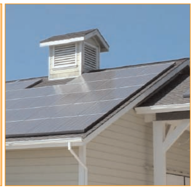
Sharp multi-purpose modules offer outstanding performance for a variety of applications.