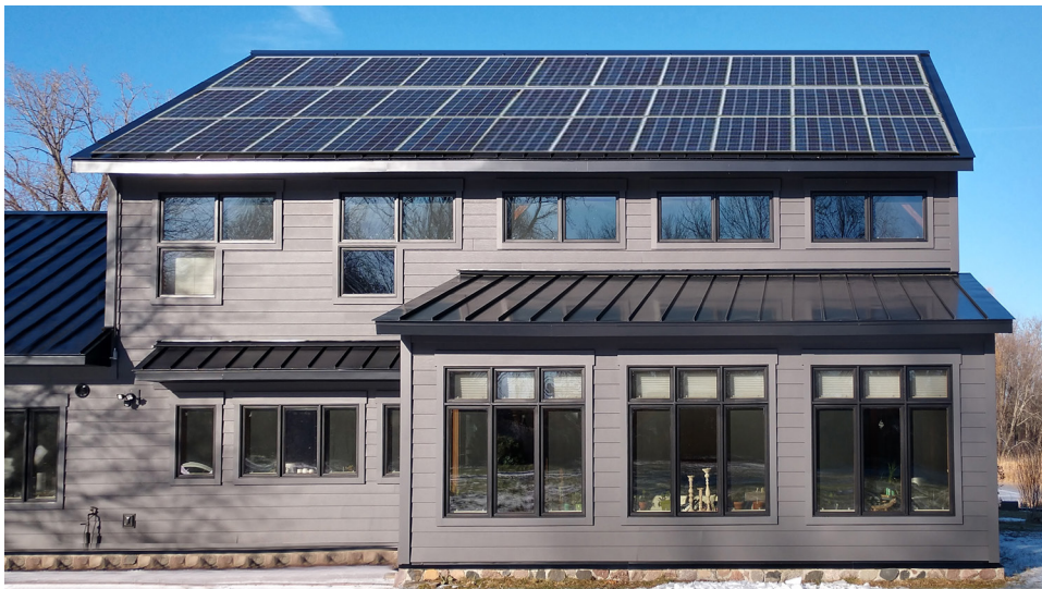
Rendering of Installation with Traditional Panels