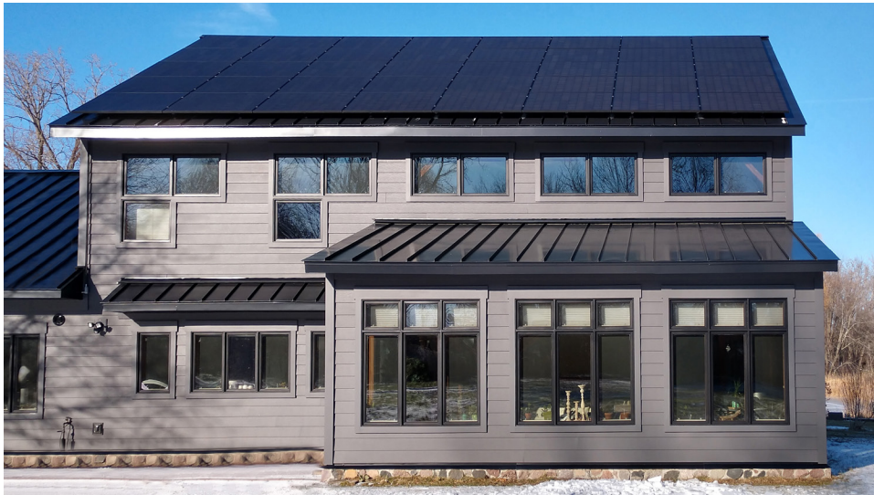
Actual Solaria PowerXT Installation

With 20% more energy per square meter than traditional solar panels, Solaria's advanced PowerXT ® panels generate maximum power in minimum space.