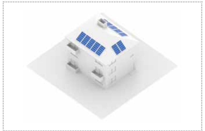
Multiple orientations, no problem: Installers can now use roof space on multiple sides of a home to generate power.