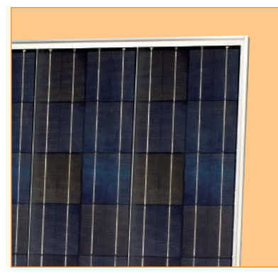
Solder-coated grid results in high fill factor performance under low light conditions.

This poly-crystalline 208 watt module features 12.8% module efficiency for an outstanding balance of size and weight to power and performance. Using breakthrough technology perfected by Sharp's 45 years of research and development, these modules use an advanced surface texturing process to increase light absorption and improve efficiency. Common applications include office buildings, cabins, solar power stations, solar villages, radio relay stations, beacons, traffic lights and security systems. Ideal for grid-connected systems and designed to withstand rigorous operating conditions, Sharp's ND-208U1 modules offer maximum power output per square foot of solar array.